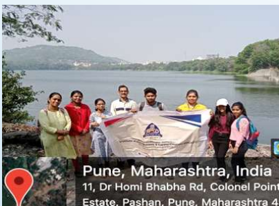
Pune, Maharashtra, India 11, Dr Homi Bhabha Rd, Colonel Point Estate, Pashan, Pune, Maharashtra 4

IMCC promotes overall development of students during the tenure of their academic year for skills building through extra circular activities. It enhances as a stepping stone for socialization behaviour and enrichment beyond classroom.