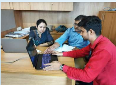
Alumni Contributing their time and knowledge in project guidance