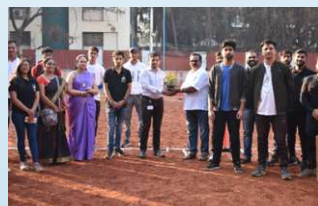
Jigyasa 2023 Prize Distribution Ceremony