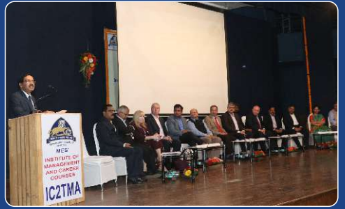
IC2TMA International Conference