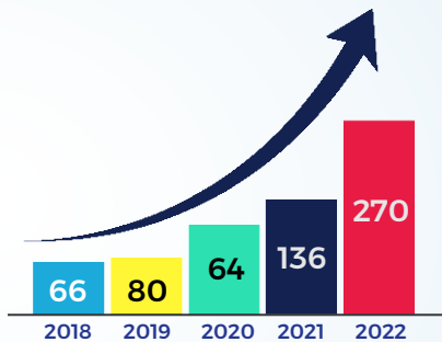
Number of companies for campus recruitment