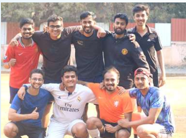
Alumni Football event

IMCC Alumni thou spread across the world stay connect with us in various forms by contributing their knowledge, skills and experience