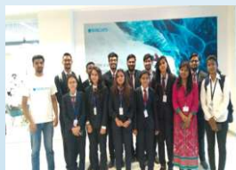
Industry Visit is organized to Barclays in association with Rubicon as part of our MoU for MCA students