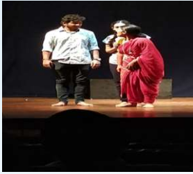
Students Participating Purushottam Karandak