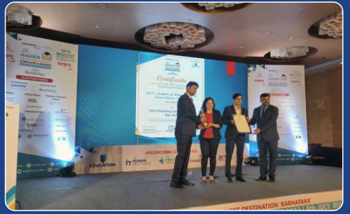
"Most Promising Institute in India" by Higher Education & ED Tech Conclave & Awards