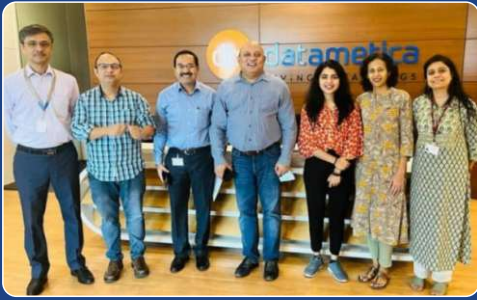
IMCC- DataMetica MOU Signing