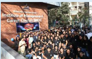
Jigyasa 2023 Inauguration Ceremony

Jigyasa event is hosted by IMCC every year. This event is a platform for students to explore their skills and potential to the core. This event has seen tremendous response from diversified colleges across Pune and other cities too. Jigyasa has witnessed overwhelming response of response of 3000+ students participating from various colleges. The rudimentary essential vision & motive behind organizing this event is to stretch and enrich our student's endowment. Numerous competitions are engaged under this canopy. Jigyasa stands apart from rest of the events conducted across Pune College as the vital vision and objective focuses on "By the students – for the students"