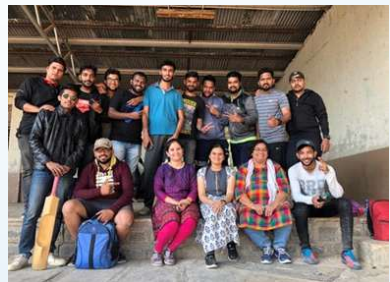
Alumni Cricket event