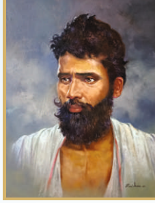
संस्थापक आद्य क्रांतिवीर वासुदेव बळवंत फडके जन्म - इ.स. १८०९ पुणे - १४ सप्टेंबर १८८३