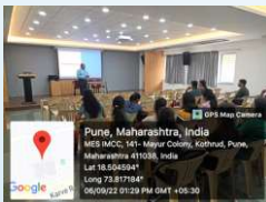
Soham Dadarkar Academy: Communicating Skill Training