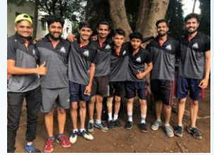
IMCC Football Match