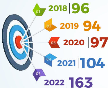
Number of students placed in recent years

A meticulous academic procedure has equipped students with proficient and special skills to do extremely well in various demanding situations with ease and confidence.