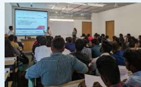
"Golden rules of good finance management" Under the collaboration with DeAsra Foundation