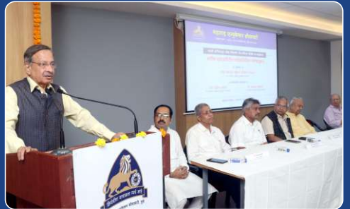
Inauguration program of new building on campus