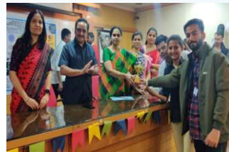
IMCC Students participating at IT Quiz in YMCA college