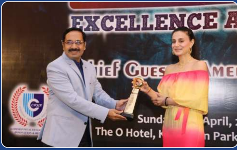
"Best Education Institute in Pune" Award by Commonwealth Society of Innovative and Research