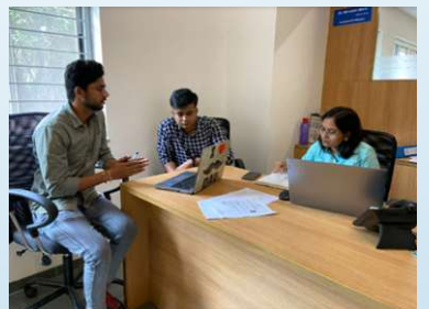
Alumni guidance in projects