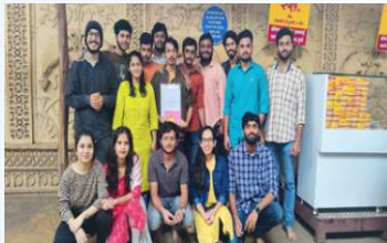
IMCC Team participating in various events