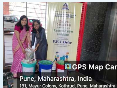
Pune, Maharashtra, India 131, Mayur Colony, Kothrud, Pune, Maharashtra

Ram Nadi Parikrama water Restoration campaign 2023, Faculties and students @ Pashan Lake Pune